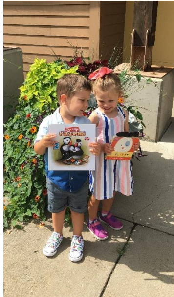
Two of our most recent graduates from the “1,000 Books Before Kindergarten” Program. Congratulations!