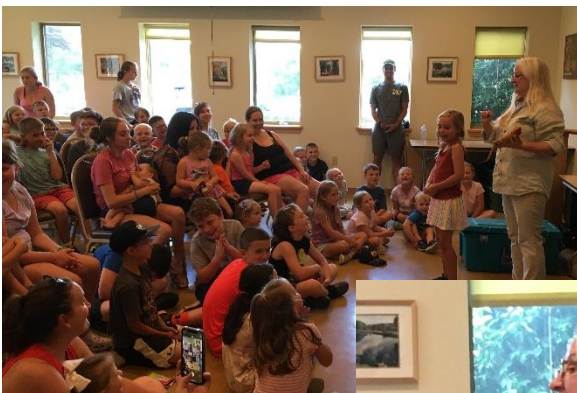
Over 90 people attended the Reptile Program this summer. The Blue-tongued Skink was a big hit.