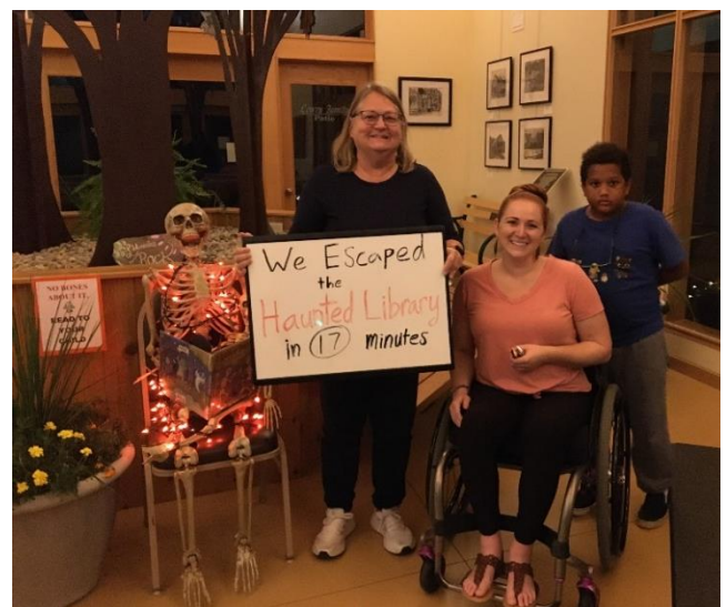
New this year was our “Escape the Haunted Library” event. Teams of up to five participants were locked in the library and had 30 minutes to find the clues and solve the riddles in order to escape.